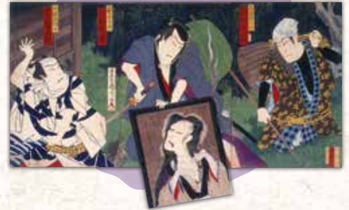
'Yotsuya Kaidan : Scene of Panel Revolving' by Toyohara Kunichika In a collection at the EDO-TOKYO MUSEUM of Art

Explore the history of Kabuki and Fukagawa.